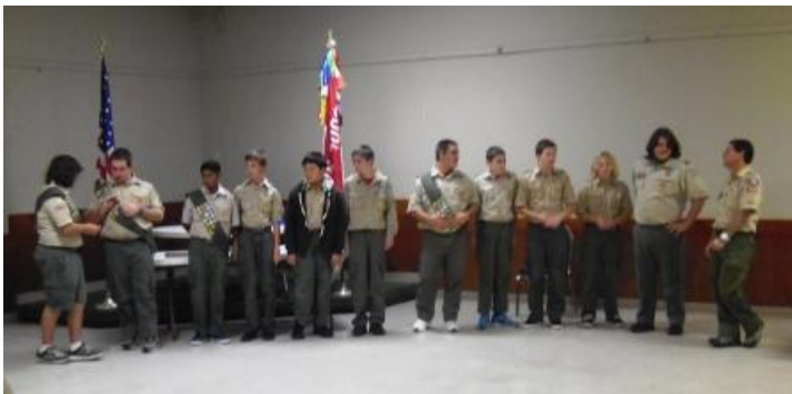
Not sure what we all were doing here, but almost every Scout was up for recognition!