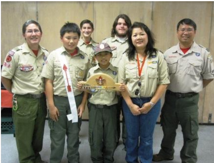
Mom joins in the photo.