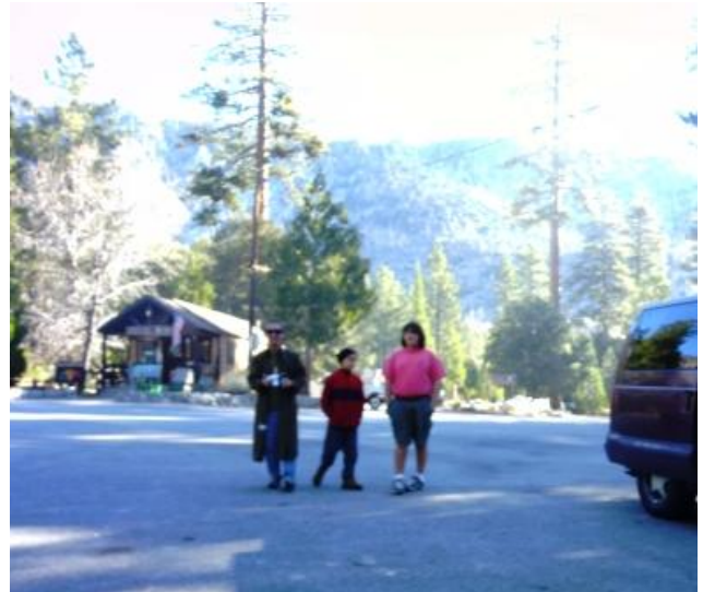
Usual Suspects, different scenery

There is a nice little Crystal Lake Cafe and Trading Post (626-910-1029) where we enjoyed some breakfast and lunch. The place is run by Adam Samrah – though technically you can pay cash only, turns out Adam lets no one go away hungry - he lets you mail in a check for our food when you get back home!