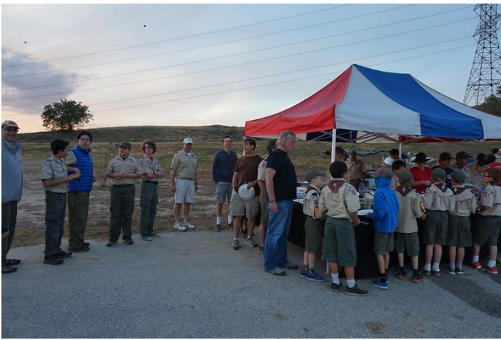
Scouts waiting in line for Friday dinner.