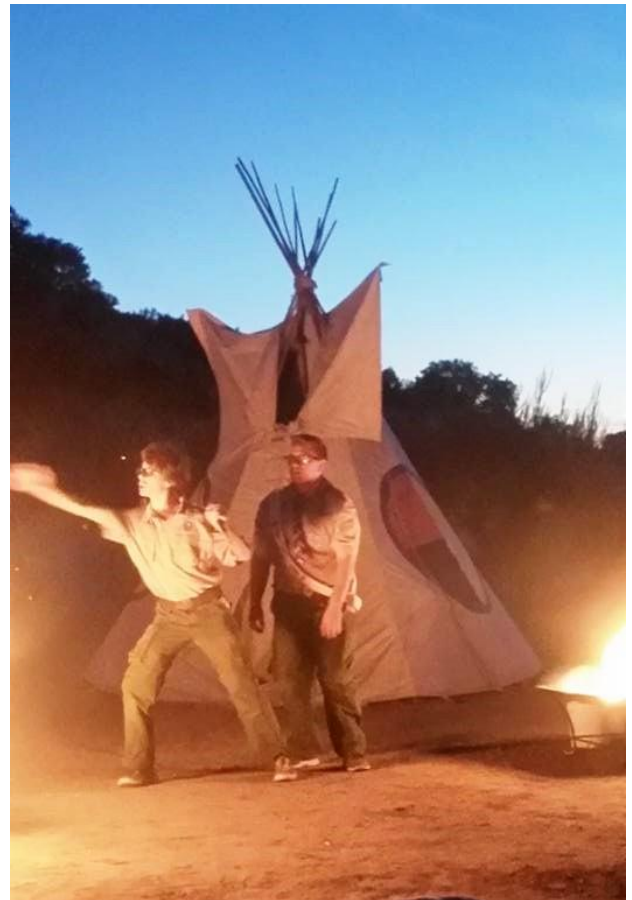
Stall for time...