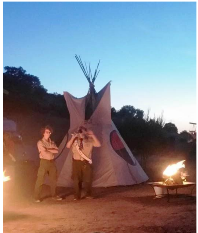
Christian at campfire