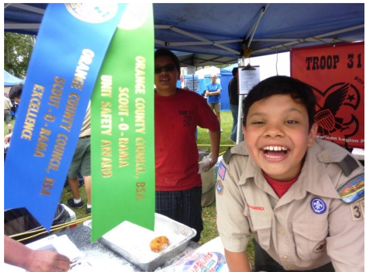
Troop Booth won Unit Safety Award and Excellence Award!