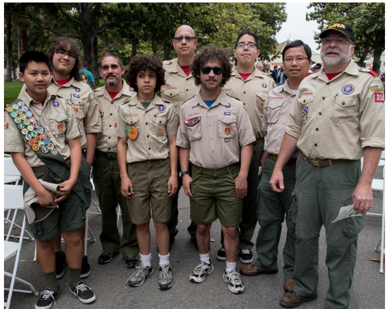
Troop Picture